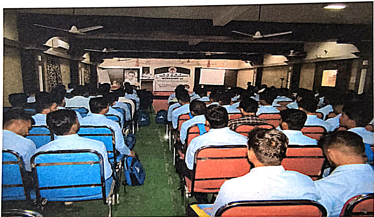
A Session on Universal Human Values