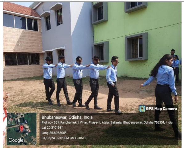
Out-bound Exercise- OB/ Behavioral Modification