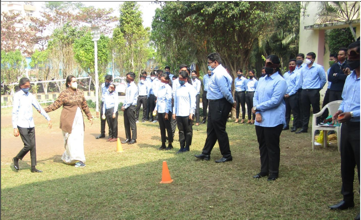
Out-Bound Training- Team Effectiveness