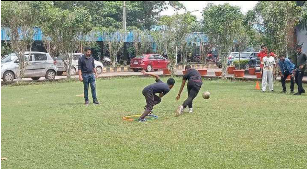
Roll the Ball - Team Dynamics, Leadership, Strategy