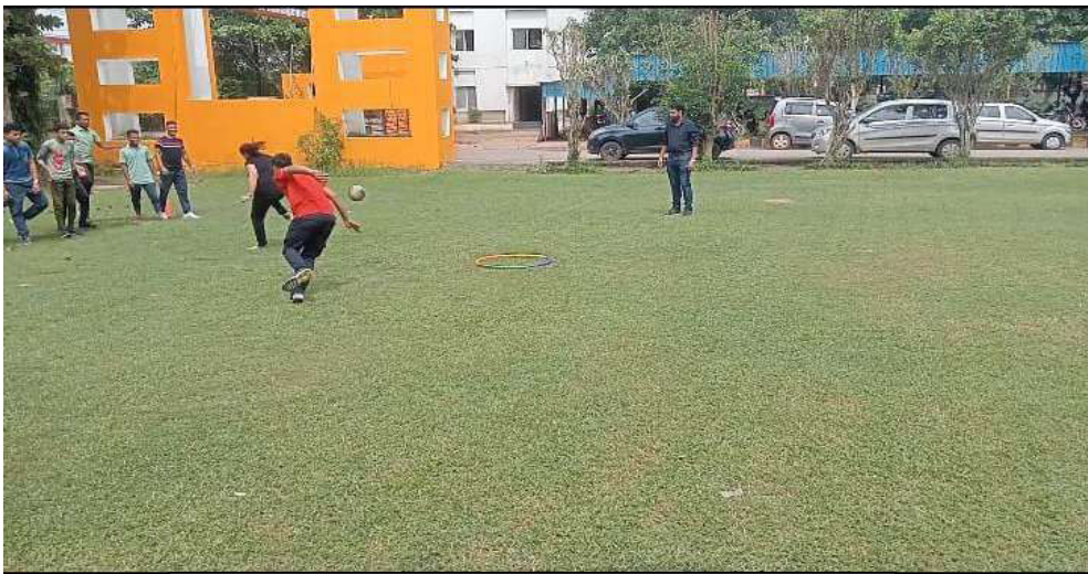
Roll the Ball