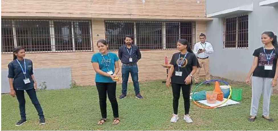
Women in the Ring- Gender Sensitization