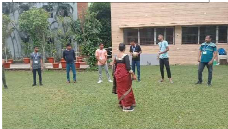
Message Decipher- Communication