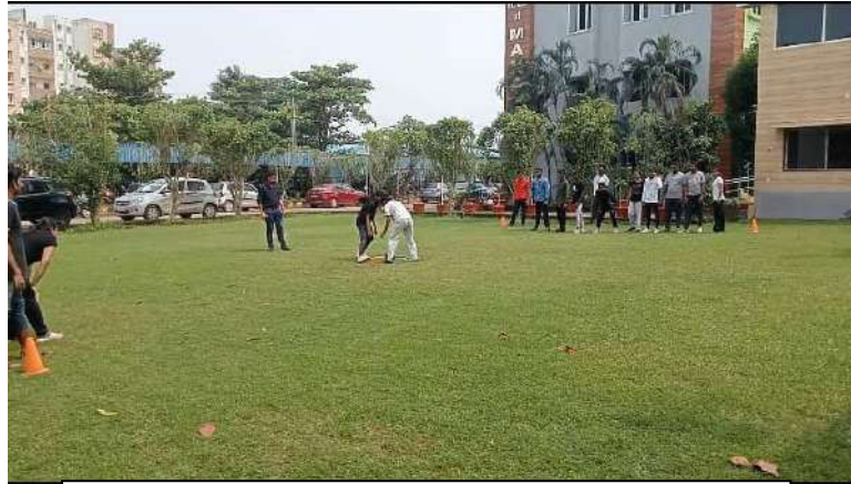
The Monkey Game - Attitude Shaping