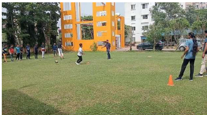
Dodge Ball- Team Dynamics, Leadership, Strategy & Gender Sensitization